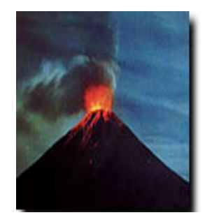
So what is heuristic training? Well it's learning directly from the source... like taking a lesson on "inner fire" or "will power" from a live volcano!!!